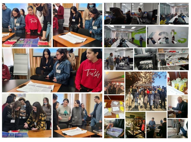
From 4-11 December 2021 NanoQIQO SOP 2021 was organized at RAU within our project...